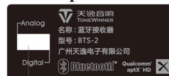
Bottom plate label

5. Unplug the BTS-2 power supply and it will automatically disconnect. When reconnecting, just click the "Audio BT" connection displayed on the Bluetooth device.